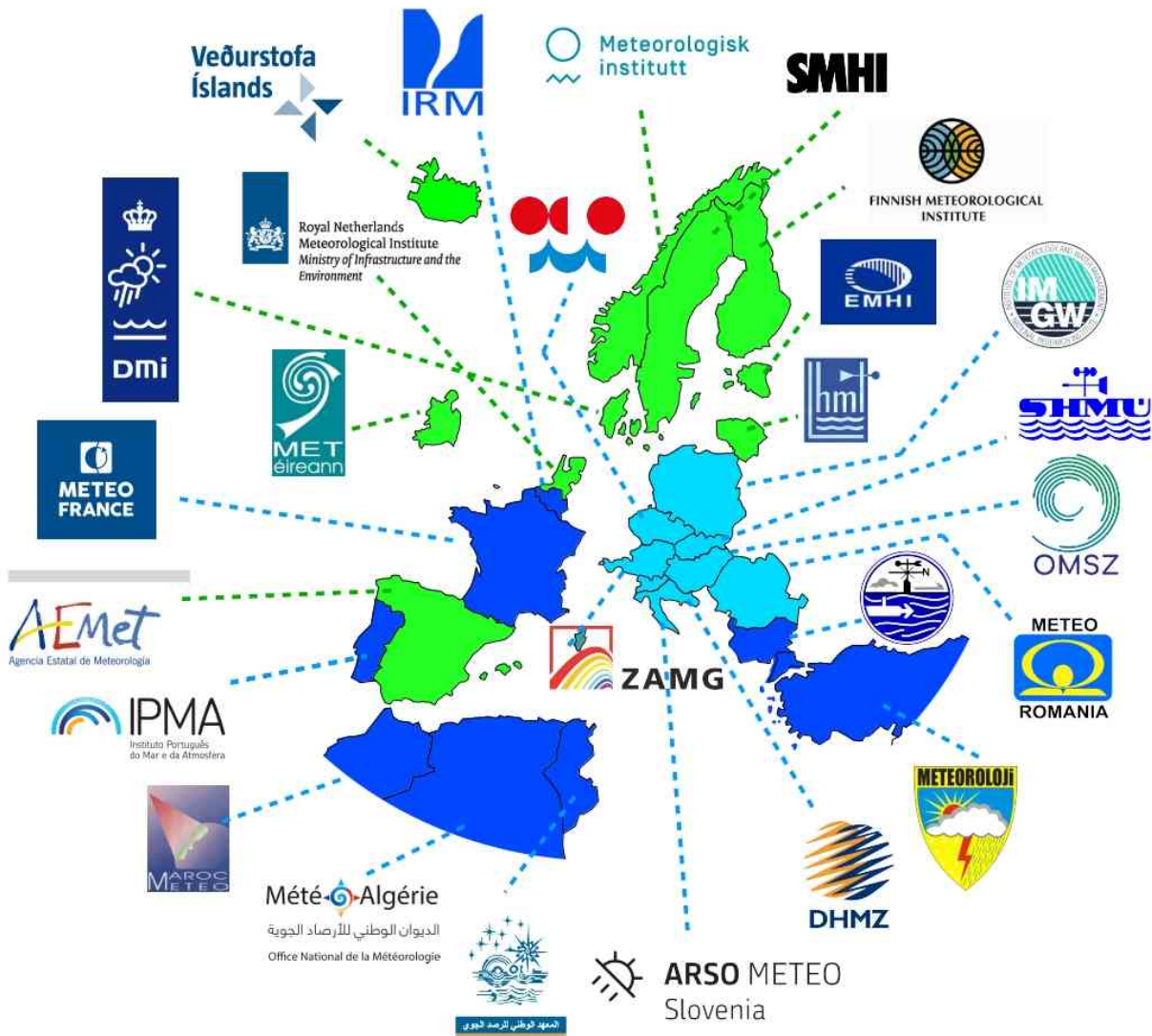
Figure 1. Map of ACCORD Member NMSs. The NMSs that are also Members of HIRLAM or of LACE are represented in green, resp. cyan.