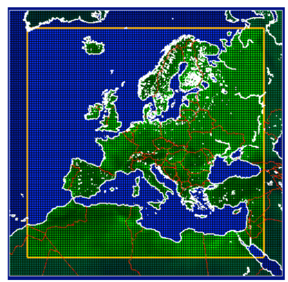
Figure 1: EURO-CORDEX region

• Coordinate joint evaluation in the European region: GCM evaluation, RCM evaluation, reference datasets.