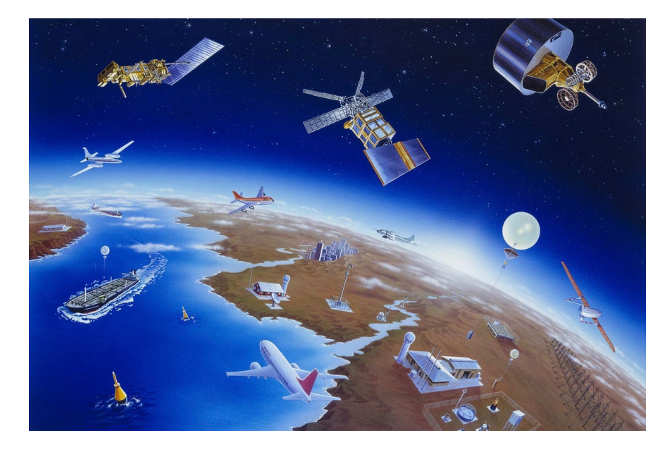
Figure 1 The WMO Integrated Global Observing System (WIGOS) combines the observing capabilities of surface- and space-based platforms and stations to serve a variety of weather and climate needs. ( Graphic: WMO )

As part of a rolling requirements review, Statements of Guidance are produced in several application areas. These feed into a vision document which gives high-level guidance on how observing systems should develop. A 'Vision for WIGOS in 2040' is currently under review. One of the developments acknowledged in the draft Vision is the increasing variety of organisations that are running observing systems of interest to WMO application areas. The aim, strongly supported by ECMWF, is to integrate these observations into one overall system where possible.