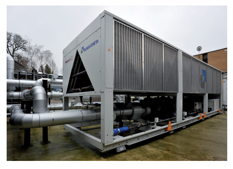
Figure 2 One of ECMWF's Turbocor based chillers.

The centralised chilled water systems at ECMWF use packaged air-cooled chillers incorporating Turbocor compressors (see Figure 2) that are designed to be more efficient at part load and at low ambient air temperatures. Traditional screw or reciprocating compressor based chillers are most efficient at full load, and the efficiency variation with ambient temperature is minimal. The average annual efficiency for a Turbocor based chiller is between 5.5 and 6.5, as opposed to being in the range 3 to 3.5 for a more traditional style chiller. This means that a Turbocor chiller uses half as much electricity as a conventional chiller to provide the same cooling. All chillers at ECMWF operate at less than full load because they are run in a redundant mode with spare capacity available, and they run continuously throughout the year as in most data centres. Consequently the saving to be made using Turbocor compressors is significant.