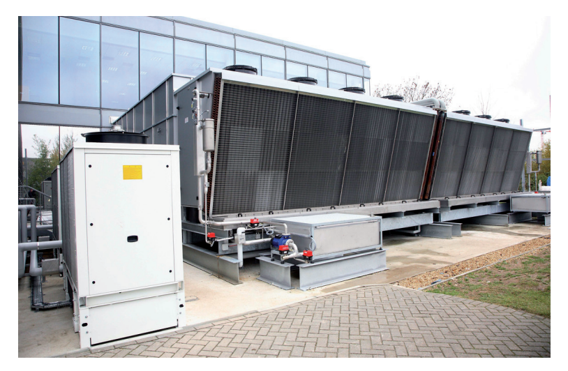
Figure 3 External view of a typical free cooling module.