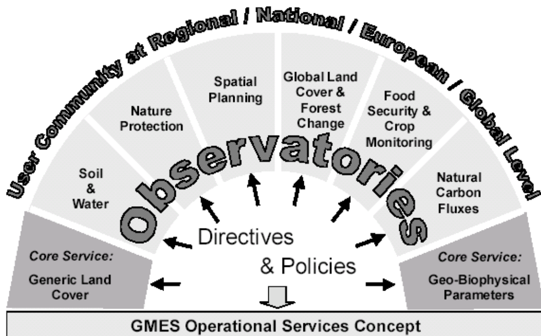
Figure 1. The geoland European project (2004-2007). The global monitoring for environment and security (GMES) activities of the European Commission (EC) and European Space Agency (ESA) is a joint effort to provide operational information by using available Earth observation resources and integrating them with existing models into pre-operational end-user applications. The geoland/Carbon (Natural carbon fluxes) observatory addresses one of the global vegetation monitoring priorities of GMES: assess carbon fluxes and stocks in the biosphere.

geoland combines 56 European service providers, research institutions, and user organisations. The broad range of “land applications” addressed by European Directives and Policies is treated by eight sub-projects (observatories) providing products and services addressing regional monitoring and reporting for nature protection, water and soil issues, spatial planning, and strategic information on food security and crop monitoring, global land cover and forest change, and natural carbon fluxes. The Earth observation data are 1)- processed by two core services (according to the observatories’ requirements) and 2)- analysed by the observatories (addressing end-user needs).