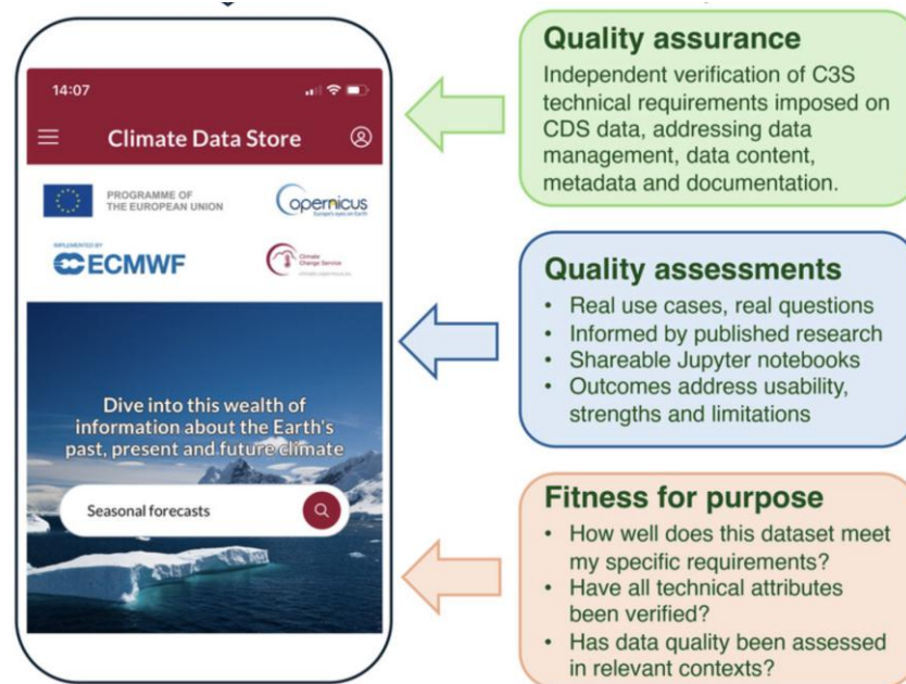
Figure 1: EQC Framework (adapted from Dee et al. 2024)

Within C3S, EQC is implemented as an operational service integrated into the CDS. EQC outputs are maintained over time, aligned with dataset updates, and presented through multiple user-facing channels, including catalogue checklists, quality assessment notebooks, and fitness-for-purpose summaries. Together, these elements ensure that users can access authoritative quality information at different levels of detail, depending on their needs and expertise.