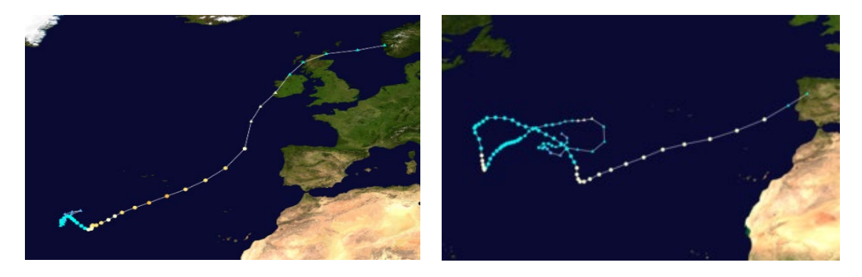
Figure 1: Anomalous tracks of (left) Hurricane Ophelia (2017) and (right) Hurricane Leslie (2018).